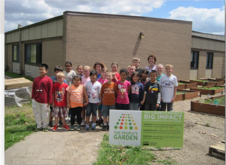
West Liberty, Permission from Linda Naeve for Photo